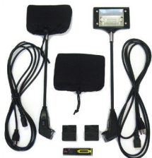
*Optional 150 watt halogen lights