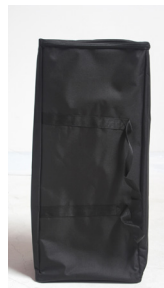
*Package includes padded nylon travel bag