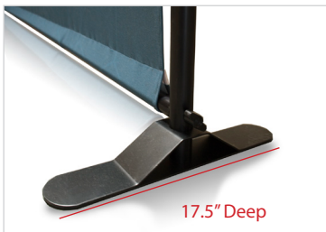
Sturdy Steel "Bridge" Support Base.