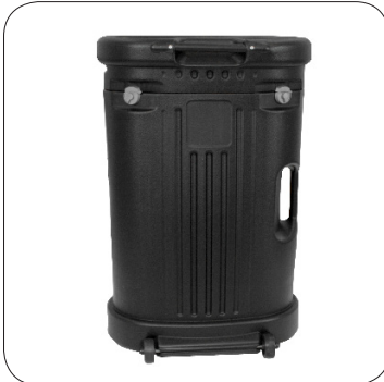
Recessed wheels and handle