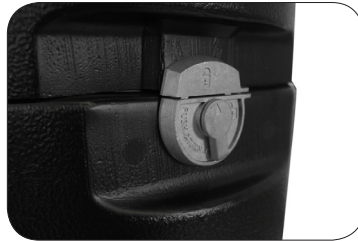
NEW push & turn locking mechanism