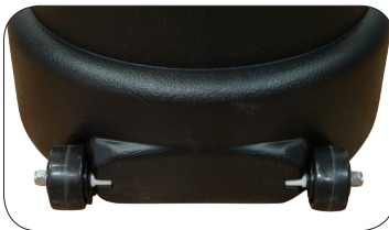
Recessed wheels and handle