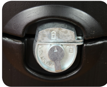
NEW push & turn locking mechanism