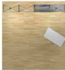
Aerial view of 10' x 10' space

The frame is shipped with the fabric skins fully attached, and the portable, lightweight frame makes your display setup in just minutes! The versatility of our 3D Snap displays make it extremely easy to change out graphics in order to create a new and original display!