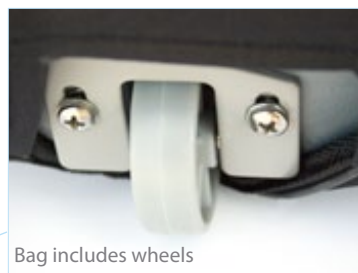
Bag includes wheels